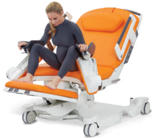
Half sitting using leg holders