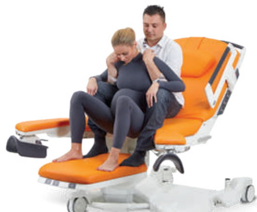
Half sitting with partner assistance