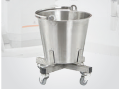
Stainless steel bowl with castors