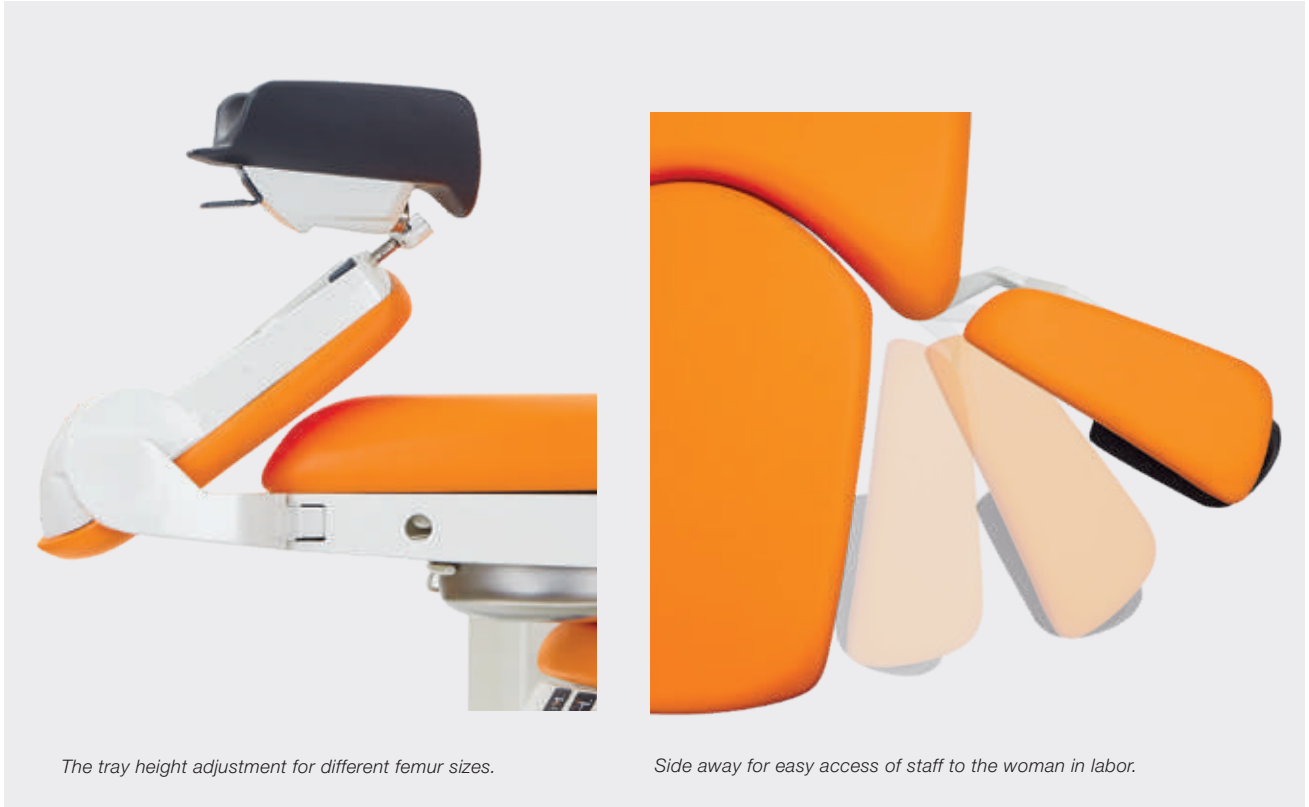
The tray height adjustment for different femur sizes.