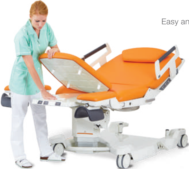
Easy and quick to clean.