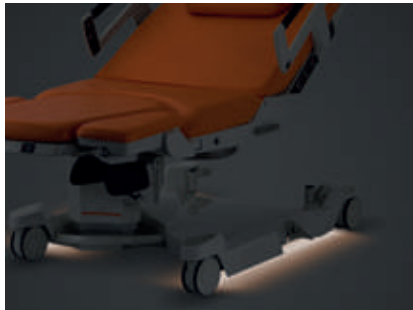
Under bed light