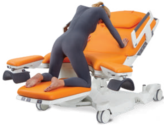
All fours position