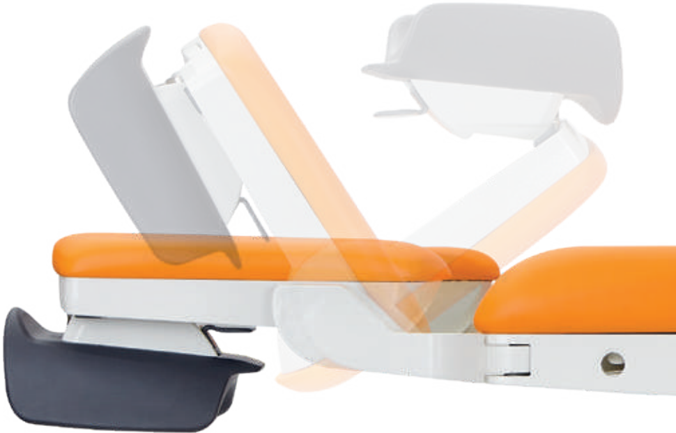
Quick adjustment of the leg rests into the required position.

The firm conception of leg rests enables the care team to respond very quickly and effectively to different situations which may occur during the delivery.