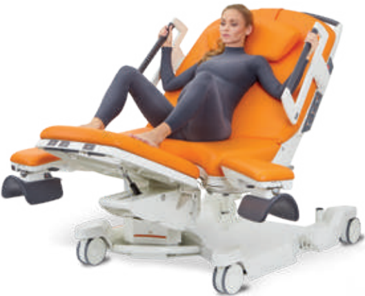
Semi recumbent position with the feet rested on the foot section