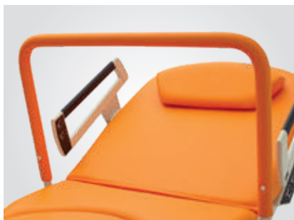
Supporting upholstered bar