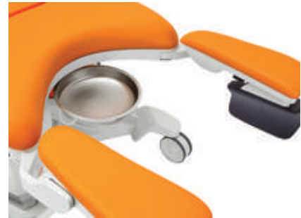
Sliding stainless catch basin 4.5l