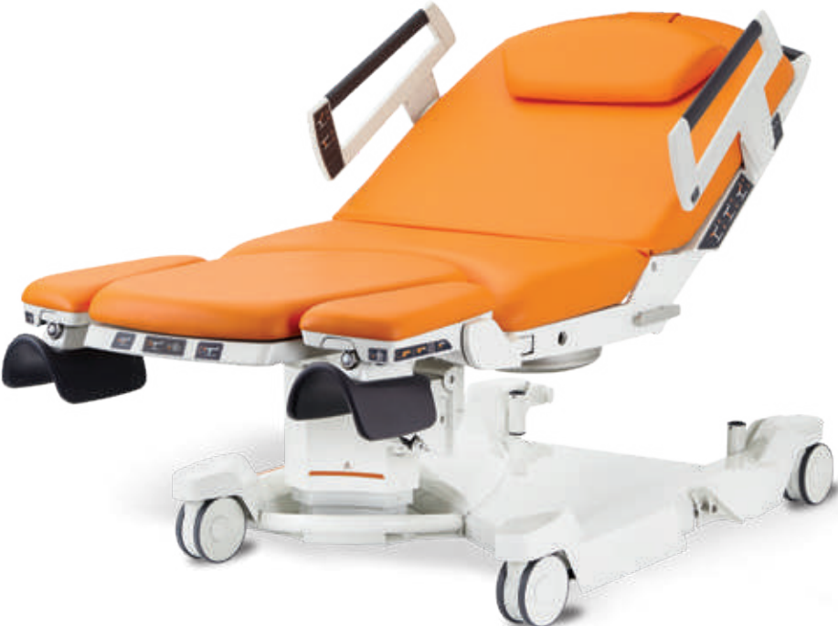
Attractive and functional design in the first impression.

Birthing bed AVE 2 is perfectly suitable for labor, delivery, recovery and postpartum in the childbirth phases, so women in labor and their families can complete normal childbearing feeling like being in their homelike rooms.