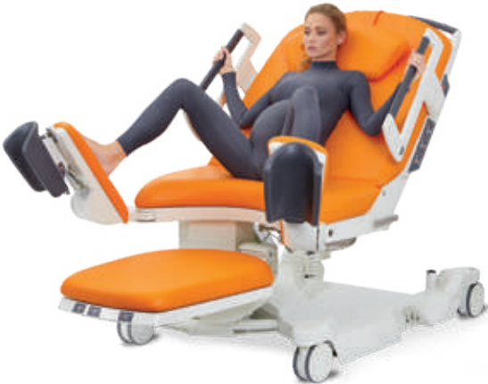
Semi recumbent position with the feet rested on the leg rests