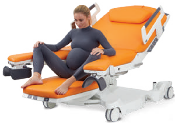
Half sitting using foot section