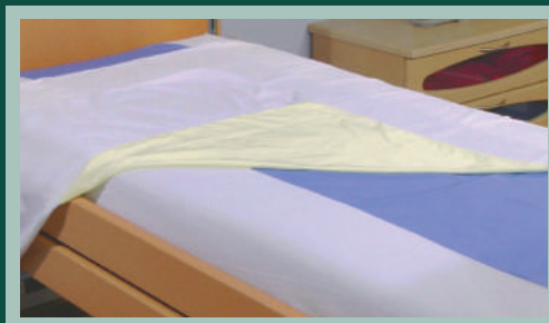
Swift® Slider Standard Length