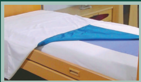
Swift® Slider Long Length