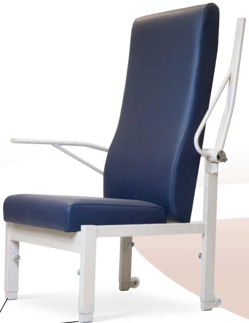
Height Adjustable Legs